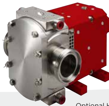
Optional Heat Saddles